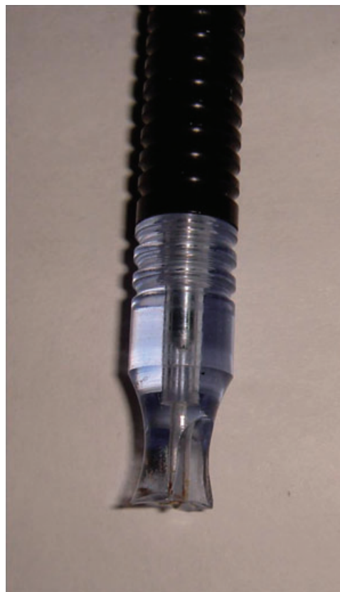
Figure 1. New contact probe for micropulse transscleral cyclophotocoagulation.

The micropulse TSCPC procedure was performed by a single surgeon in the outpatient setting. Peribulbar anaesthesia of 3–5 mL of 2% ligno-