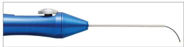
Figure 1. The ability to transform a straight probe to a curved one affords surgeons greater flexibility during intraoperative movements.

Most retinal surgeons recognize that a drawback of extendable probes is that there tends to be a reduction in power when the probe is fully extended. The surgeon then has to adjust for that loss of power either by placing the probe closer to the retina or by increasing the power of the laser. A&I XR probes have a narrow cone angle and a more consistent burn spot size and intensity (Figure 2). This allows the probe to remain at a greater distance from the retina compared with probes with a larger cone angle while providing a consistent