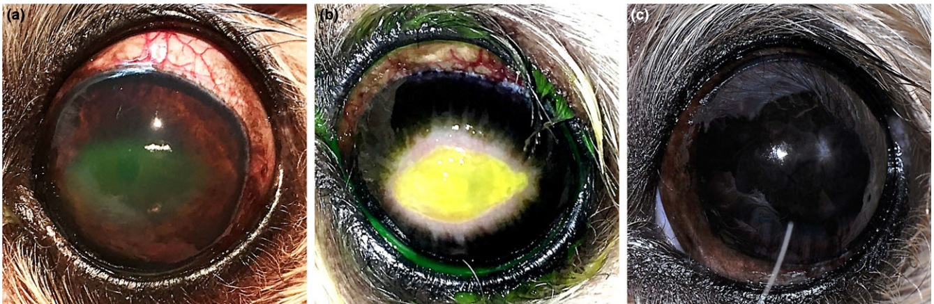
FIGURE 3 A neurotrophic corneal ulcer developed in case #4 three days following the second MP-TSCPC procedure (A). Dense granulation tissue and perilesional corneal melanosis developed over the next few weeks (B, day 59). The ulcer healed by day 120 but dense melanosis remained in the axial cornea long term (C, day 215)